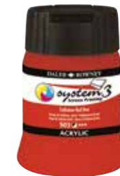
System3 Screen Printing Acrylic 2.50ml D 141 250 ***