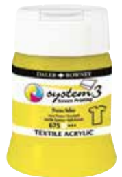
System3 Screen Printing Textile Acrylic 2.50ml D 142 250 ***